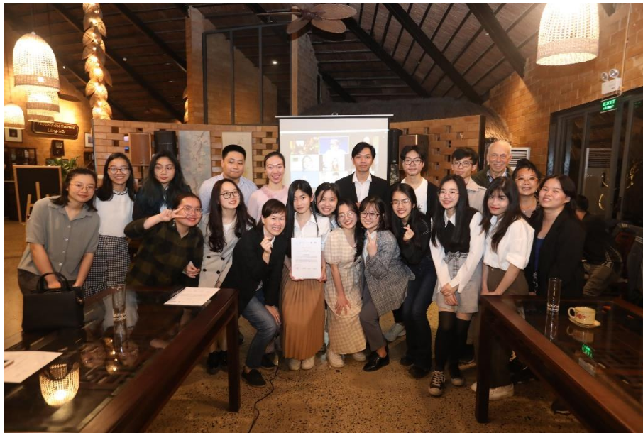
the Vietnamese participants at the Closing Ceremony